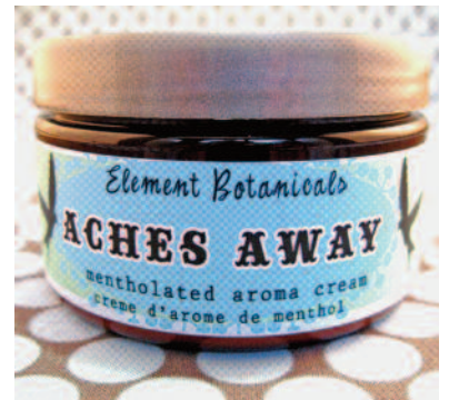
Unique handmade natural body care products by Element Botanicals