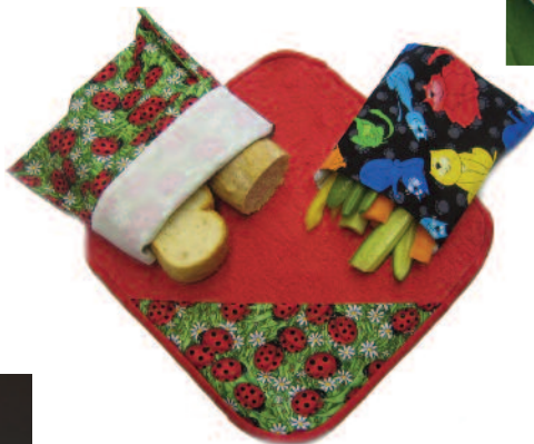
Eco-Friendly "Lunch Buddy" by Einai Designs.