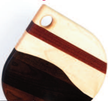
Pear inspired cutting/serving board by GKE Board and Bench