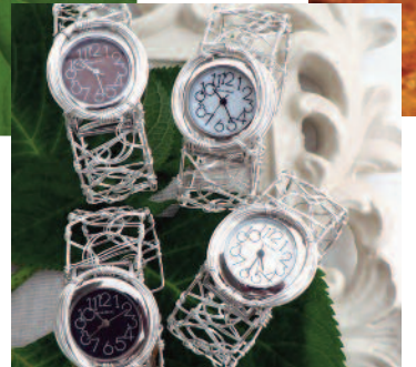
Modern wirework jewellery by Kaunis Designs.