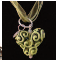
Hand formed glass jewellery by Jessica Jane Glass Art