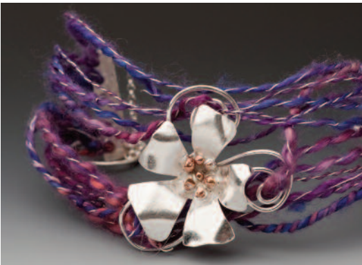
Handmade jewellery by Nan' Darach Designs.