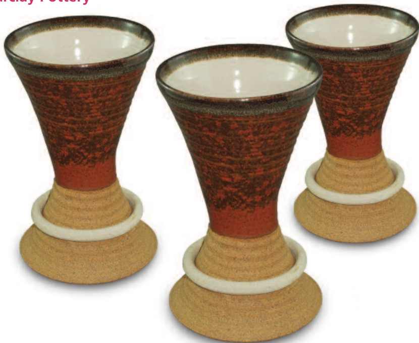
Hand thrown stoneware "Friendship Goblets" by Barclay Pottery